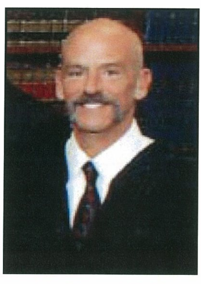
Honorable Donal B. Donnelly Presiding Judge